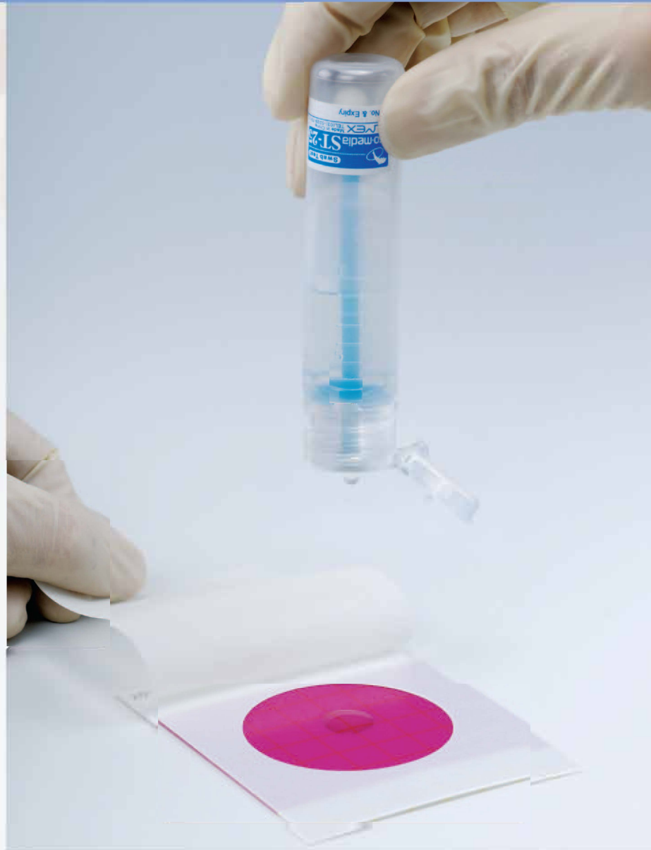
Above medium is 3M Petrifilm